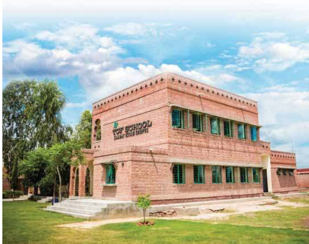
Saadat Ikram Campus, Lahore, Pakistan.